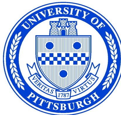
University of Pittsburgh Swanson School of Engineering